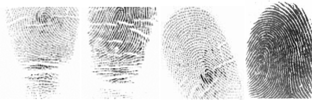
Figure 1: Dataset Images of FVC 2002

For experimentation FVC 2002 fingerprint dataset is used. It consists of latent to rolled fingerprints [4]. These images are of approximate 500 PPI. These images are taken using capacitive and sensor dataset. Some sample images are shown in figure 1.